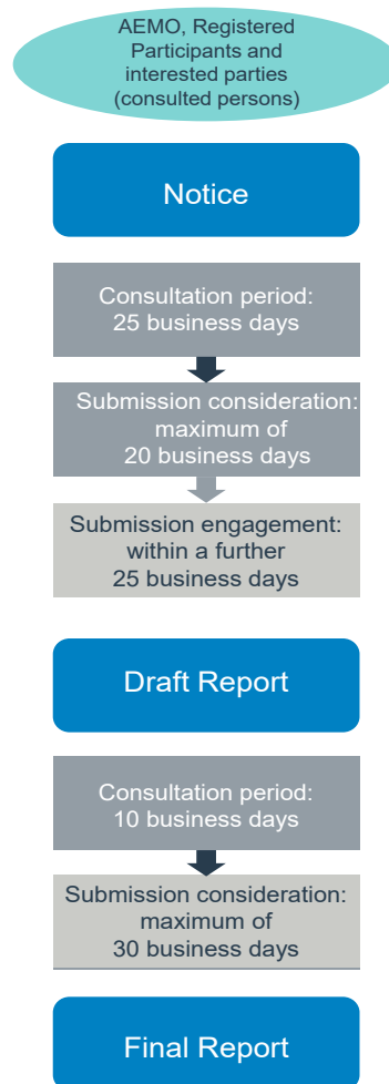
Figure 1: Funded augmentation consultation process