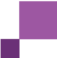
Table 4 Initial assessment of implementation risks