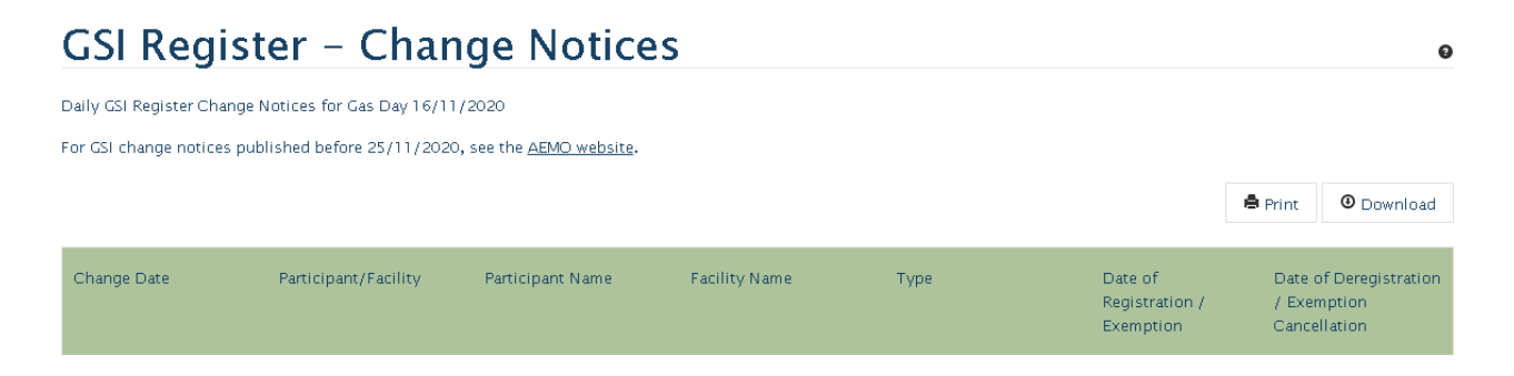
Figure 5 Reports -> GSI Register - Change Notices

All historical Noticies of Change to the GSI Register can be found in the Participants and Facilities registered for the WA GBB<sup>3</sup> section of the AEMO Website.