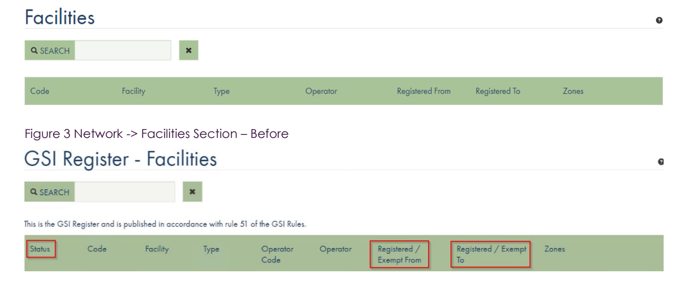
Figure 4 Network -> Facilities Section - After

The Network -> Facilties section of the GBB(WA) Website has been improved to incorporate the particulars of all Registered Facilities. The report has also been expanded to include Facilities that have been granted an Exemption. The existing column titles have been expanded to include Status, Registered / Exempt From and Registered / Exempt To.