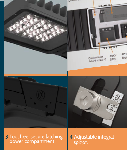
3 Tool free, secure latching power compartment