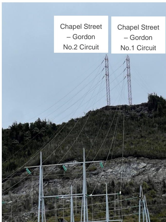
Figure 1 Chapel Street – Gordon 220 kV circuits (entry to Gordon 220 kV substation)