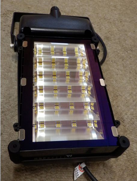
Illustration 4: Luminaire