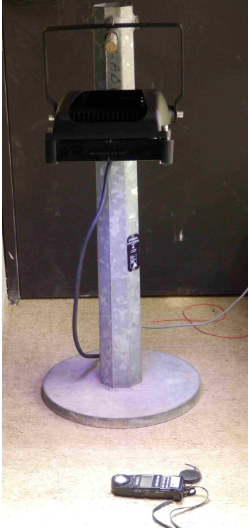
Illustration 5: Setup