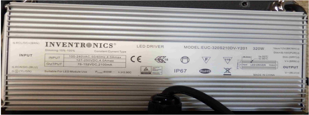
Illustration 3: LED driver