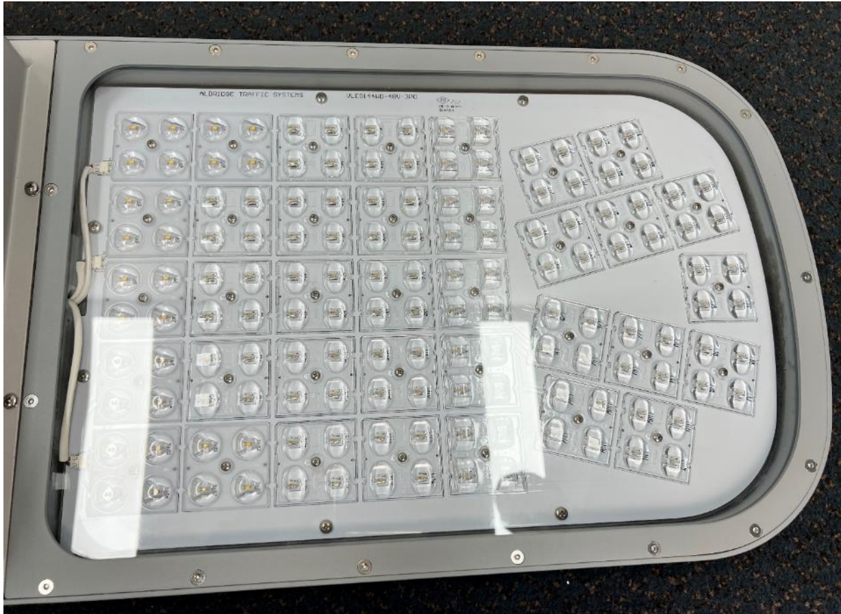
LED Module Compartment