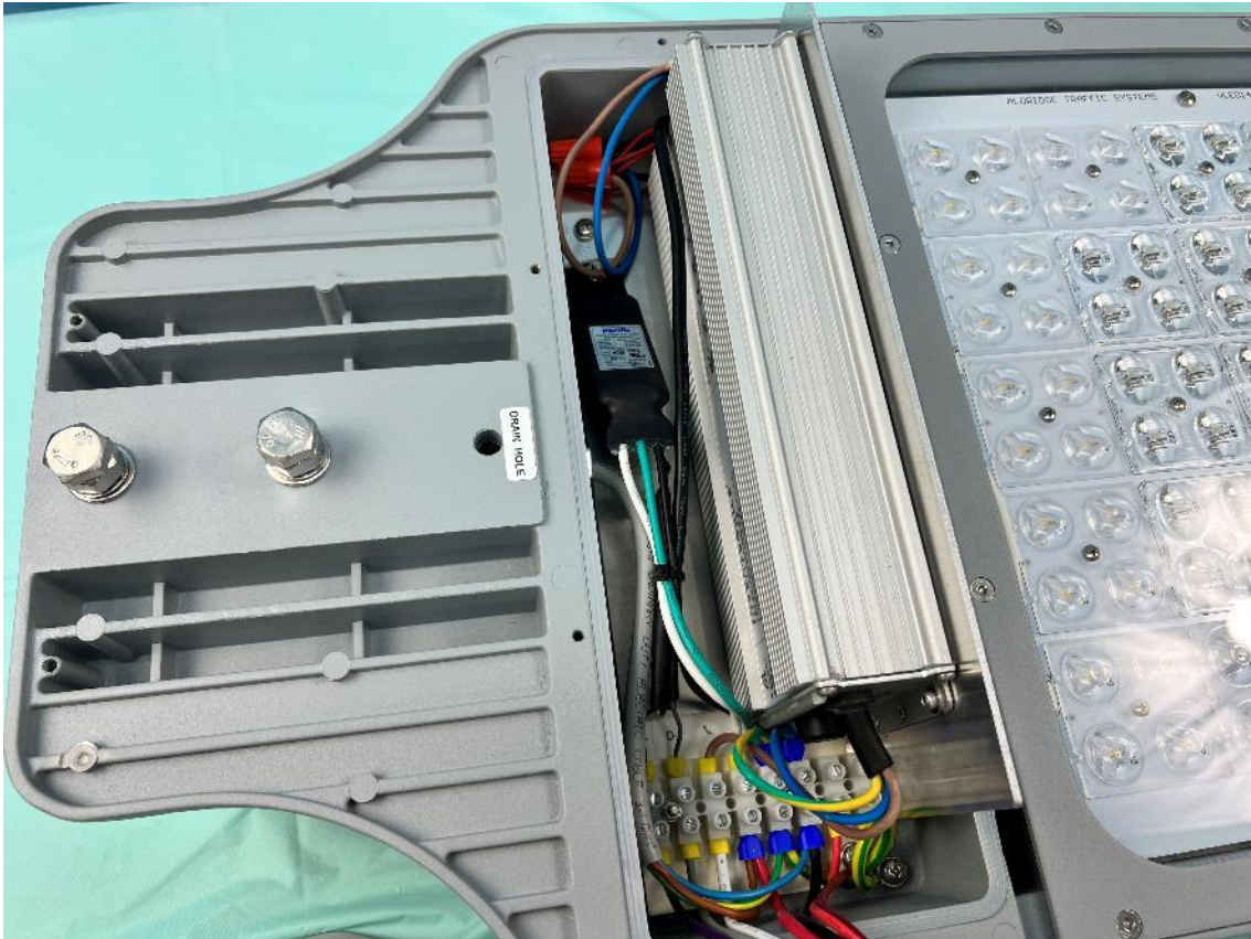
Control gear compartment