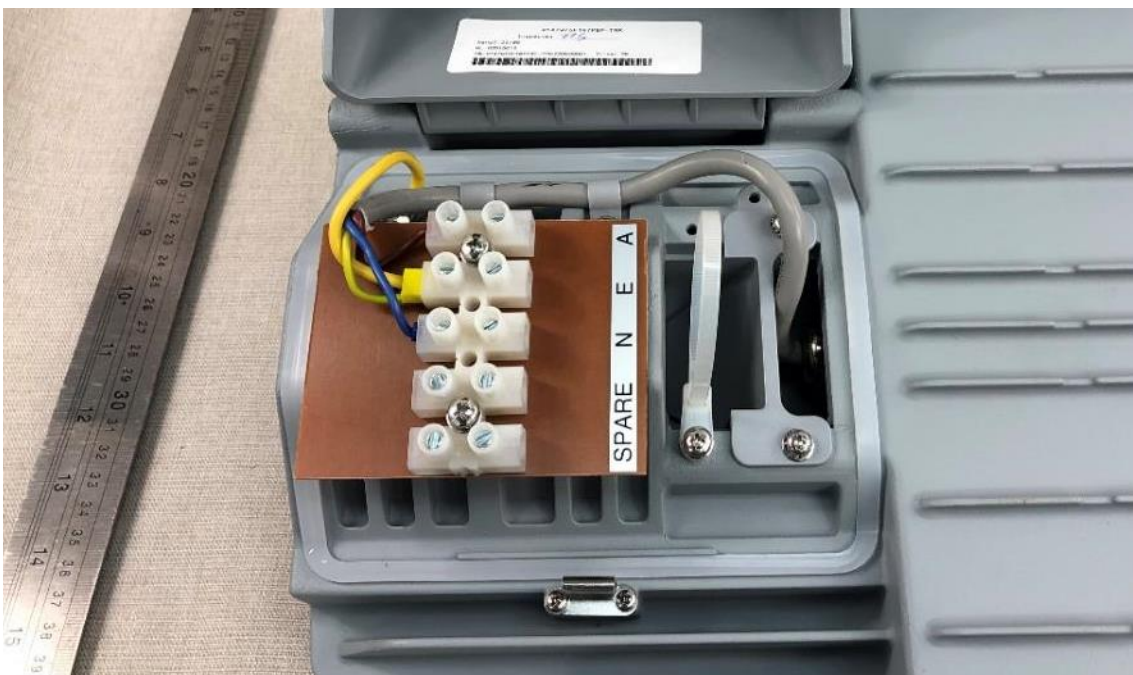
Terminal block for supply mains connection