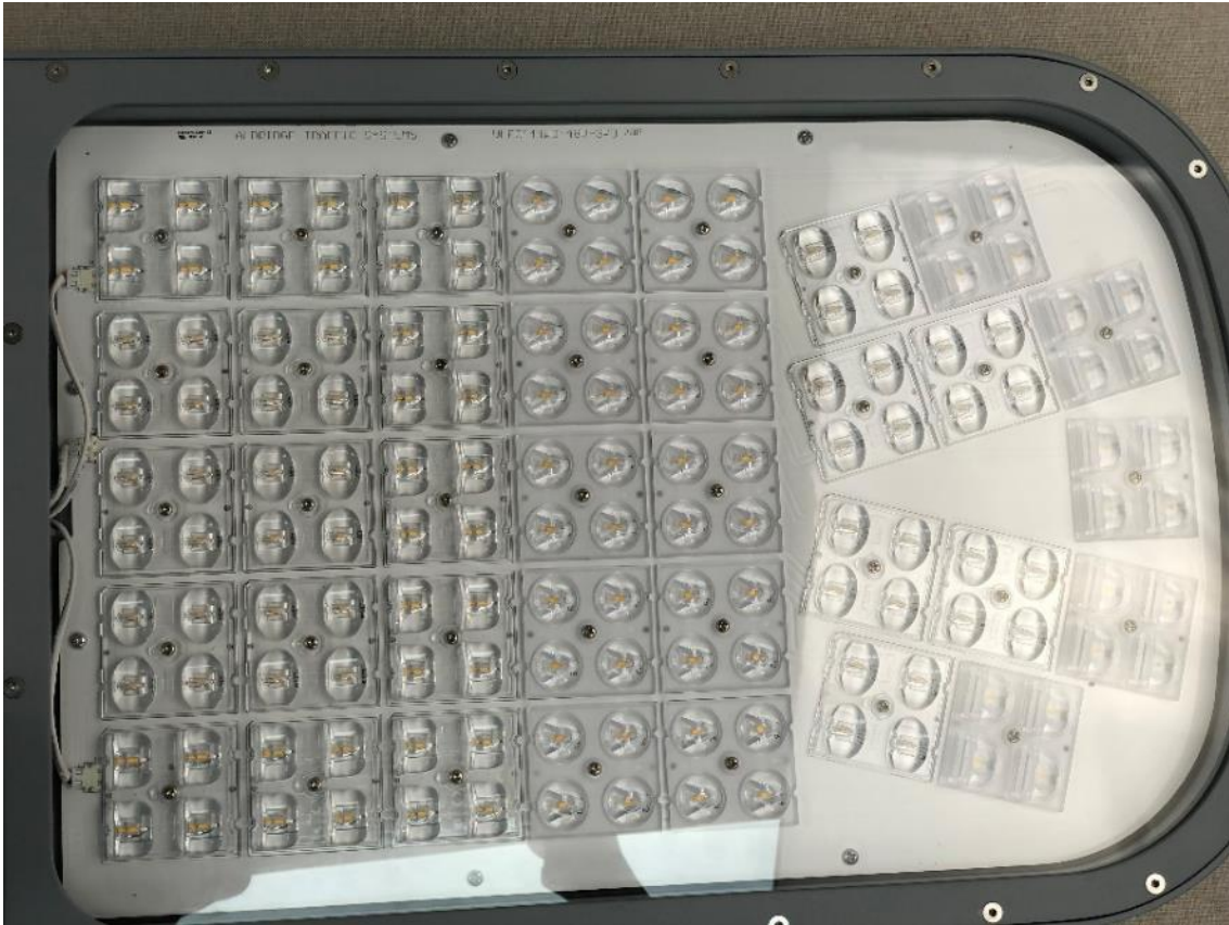
LED Module Compartment