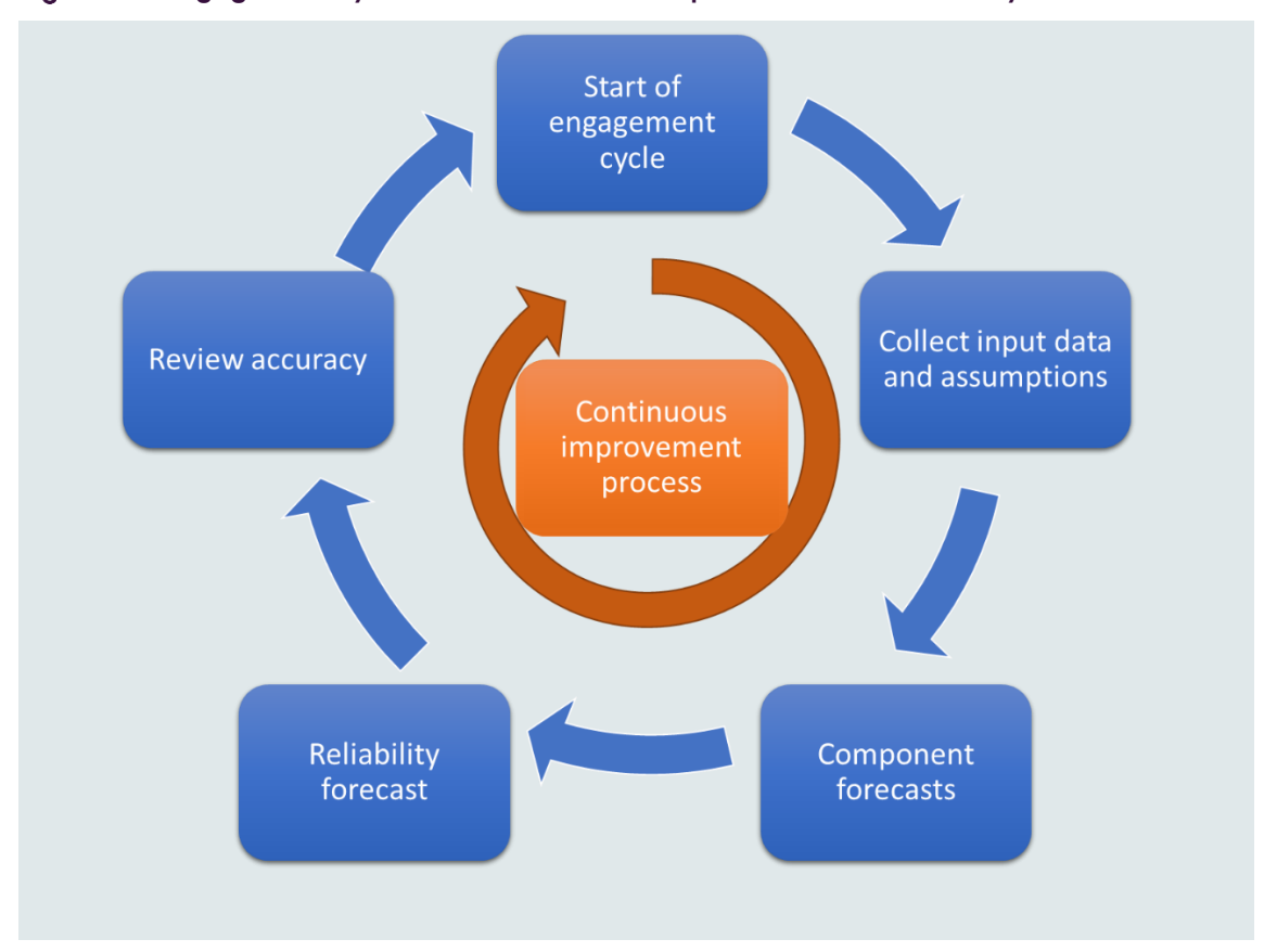
Figure 1 Engagement cycle – commences fourth quarter of each calendar year

Within the development of the annual IASR, AEMO will publish a timeline for stakeholder engagement on the development of key inputs and assumptions.