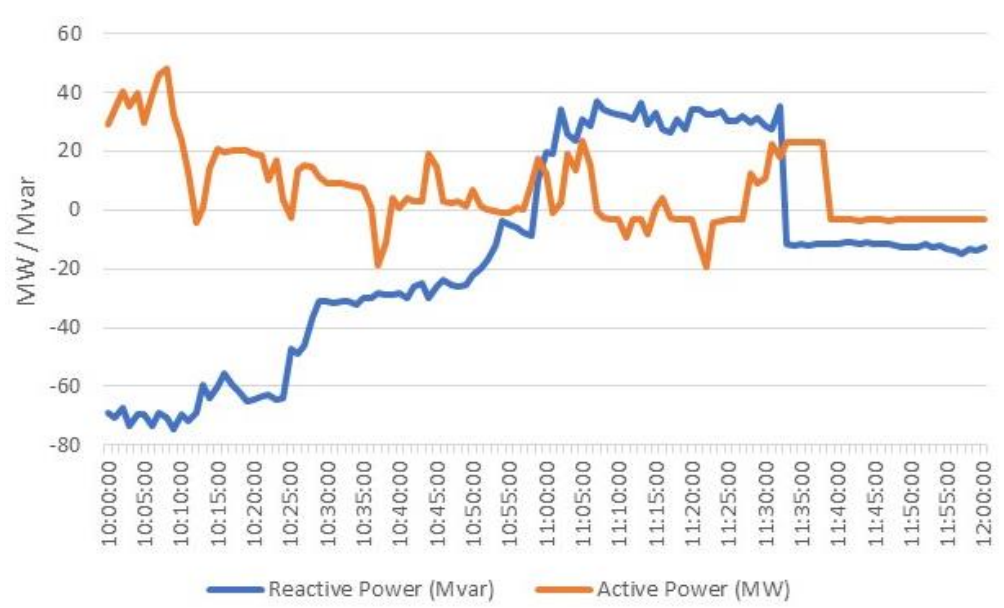
Figure 2 Northern area wind farm generation - active and reactive power output

This problem was further exacerbated by capacitor banks that were in service at Willogoleche and Snowtown North wind farms, resulting in a net rise in reactive power output from the wind farms (shown in Figure 2) and an increase in voltages in the area. As an example, Figure 3 shows the voltage levels at Willalo substation.